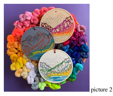
Free STLs Event 09/03/2021 (Celebrate 5-Pattern-Package Complete)

the previous ones, this pattern is from original artwork created by a Toysinbox associate. As Meeta Ahluwalia once said, clouds come and go, but the mountain stays. Start making your own inspiring mountains!